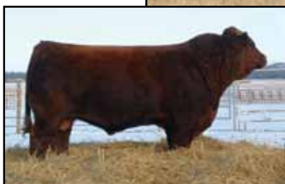
Wheatland Red Hummer 608S