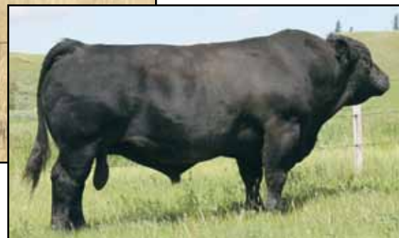
MRL Walk the Line 164W

WHEATLAND BULL 131L MRL MISS 302M TNT MR BEEF 414K LBR D-436 TNT FORTUNE BUILDER H122 TNT MISS PEACHES J107 ER RED DASH 649D X-T MISS DOC 36H