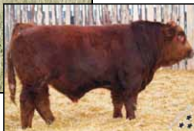
Green Spruce Simmental