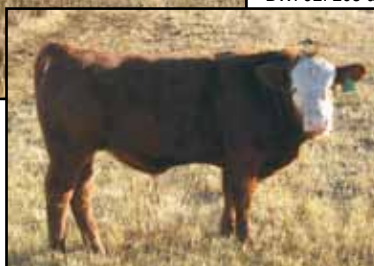
Green Spruce Simmental