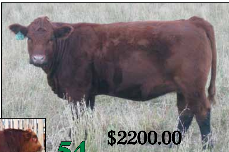
MRL Red Force 12U