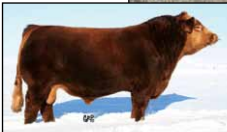
Remington Generallee 106T

A moderate heifer with Fleck in her background. Her dam is also of moderate frame, is sired by Rusty and has good milking ability.