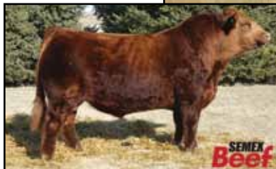
KNK/CRSR Red Bull 53T

A stylish, dark red heifer that is deep ribbed, wide topped and sired by Red Bull. This female is super attractive. Her dam is dark cherry red in color and has been a good, productive cow with good milking ability.