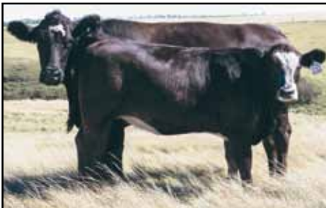
3D Miss Ultimate 142U & 29A's maternal sister