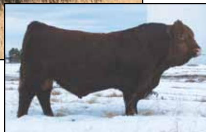
MRL Tracker 17Z

TNT ROCKY H32 TNT MISS MONTANA F135 CG HOMEBUILDER 803H TWIN-CHIEF JAVA 104J TNT PACKED POWER J235 NLC C06 CALMA ER RED DASH 649D MS WILLOW 437Y