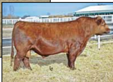
Green Spruce Simmental